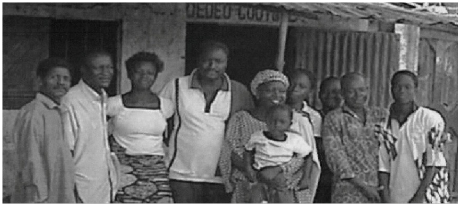
"You didn't know this but we were a Muslim family but now we are going to follow Jesus all the way!" Benin, W Africa