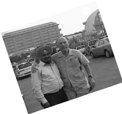
The joy of introducing this precious Sheikh to our Lord in Delhi, India